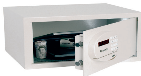
Saracen SS0936E Laptop Safe